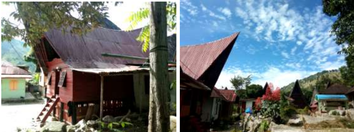
Figure 3. Homestay Bakara

Cultural Value Enhancement Activities in Bakara improve the Quality of Life of the Community, where the average community gives a value of 4.10. The cultural values activities in Bakara have been carried out by the community and also the Government, which collaborates with one another, in Bakara, there has been a Homestay development that aims to preserve the culture there, and also to improve the economy of the community, also to improve the quality of life of the community.