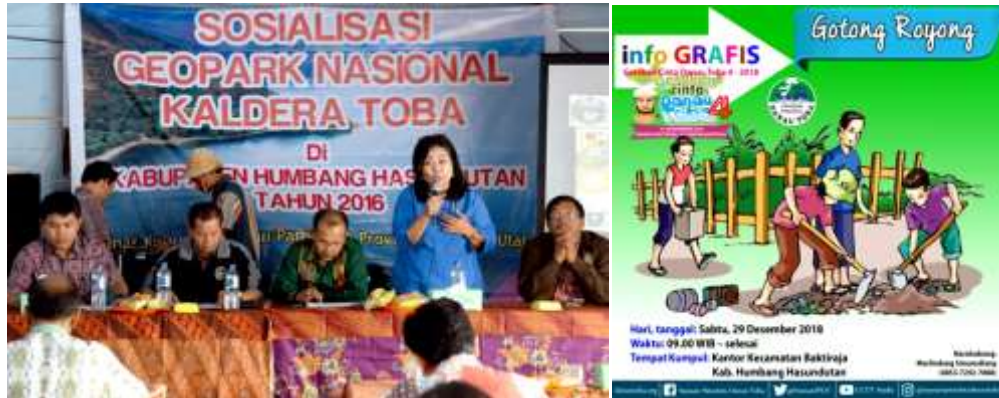
Figure 2. Geopark Seminar and Save Environment

realize the preservation of local wisdom. One of the keys to the successful development of community-based tourism is the knowledge and openness of the community to manage their environment [13].