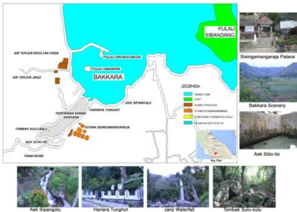
Figure 1. Research Area

This research was conducted in Bakara, Baktiraja Subdistrict, Humbang Hasundutan District (Figure 1). There are various famous tourist attractions in Bakara, such as ; (a) Sisingamangaraja Palace, this area is intended for historical tourism, because it is the hometown of Sisingamangaraja, one of the famous kings of the Batak region. The historical evidence is still well maintained. Sisingamangaraja dynasty stood in Bakara + _ 1530 - 1907 led by Raja Sisingamangraja I - XII. The hereditary kingdom has a palace in Bakara. Inside the Palace, there are Tombs of Raja Sisingamangaraja X, Tomb of Raja Sisingamangaraja XI, Ruma Bolon, Ruma Parsaktian, Sopo Bolon, Bale Pasogit, Batu Si revealed. Raja Sisingamangaraja Palace was burnt by Tuanku Rao's forces in 1825 and Dutch troops in 1878 and was rebuilt by the government and the community since 1978.; (b) Bakara Scenery has functioned as Staging and Stop points, there are seats and pavilion which functions for tourists and residents, to see the views of Baktiraja District. Bakkara Scenery is also a lot of shady trees that make the area shady, and also the cool air.