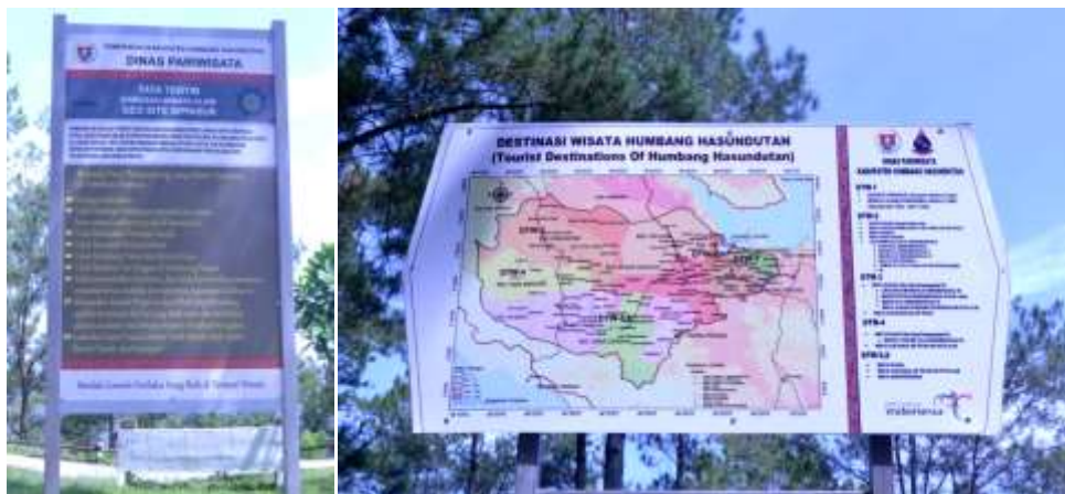
Figure 6. Geopark Signboard

Geosite development has the goal of increasing environmental sustainability and sustainable environmental development. Appreciation of cultural values and world heritage through education and interpretation can also improve people's quality of life, empower local communities and realize the preservation of local wisdom. One of the keys to the successful development of community-based tourism is the knowledge and openness of the community to manage their environment [13]. With the development of Geotourism, it can increase tourism and provide benefits to the community. The development of Geotourism improves the quality of life of the Bakara community, where the value is 4.09. In addition to providing income for the community, the development of Geotourism is expected