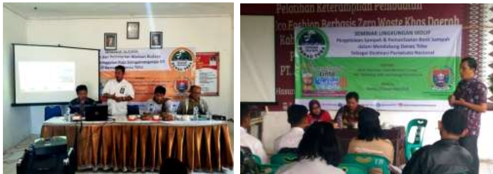
Figure 5. Educational Geopark Activities